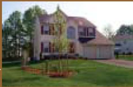
Residential Lot with Bioretention Somerset Development Prince George's County, MD

Ever wish you could simultaneously lower your site infrastructure costs, protect the environment, and increase your project's marketability? With LID techniques, you can. LID is an ecologically friendly approach to site development and storm water management that aims to mitigate development impacts to land, water, and air. The approach emphasizes the integration of site design and planning techniques that conserve the natural systems and hydrologic functions of a site.