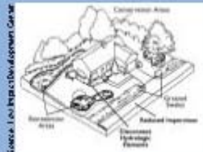
LID Lot Level Source Controls

Water moving through these systems is slowed, filtered, and percolated into the ground. These systems are at as low-cost alternatives to curbs, gutters, and pipes.